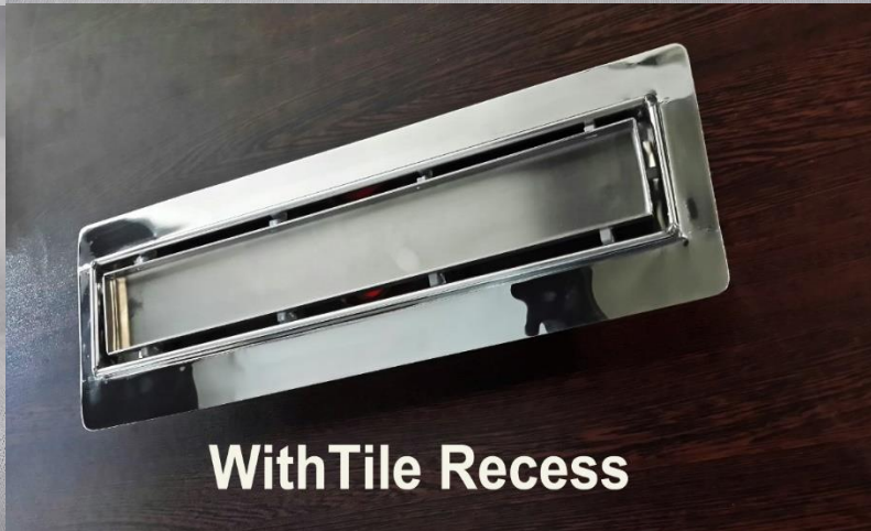
With Tile Recess